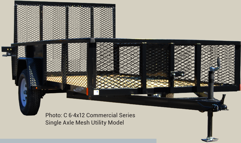
Photo: C 6-4x12 Commercial Series Single Axle Mesh Utility Model