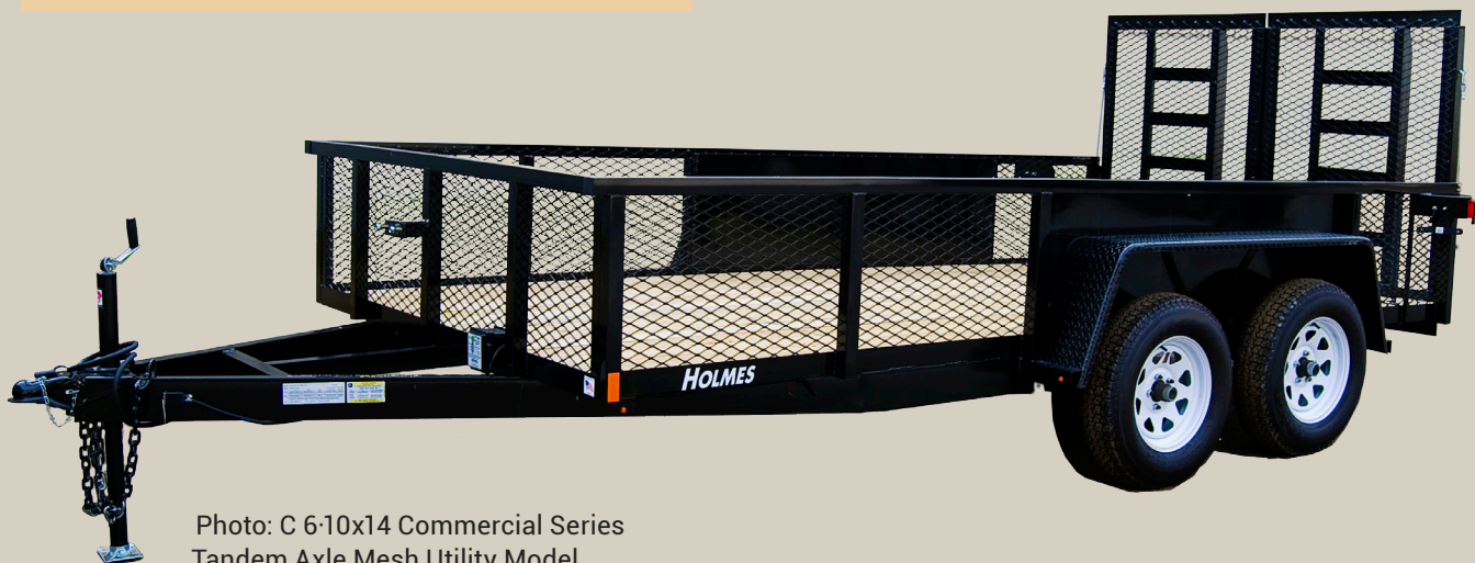
Photo: C 6-10x14 Commercial Series Tandem Axle Mesh Utility Model

The professional and weekend warrior alike will appreciate the heavy duty features that make our Commercial Utility Tandem Axle model one of our top sellers. These versatile trailers offer a solid and dependable trailer for those jobs that require more size and bulk hauling capabilities.