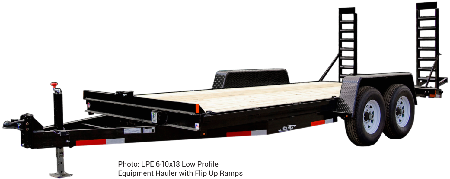
Photo: LPE 6-10x18 Low Profile Equipment Hauler with Flip Up Ramps