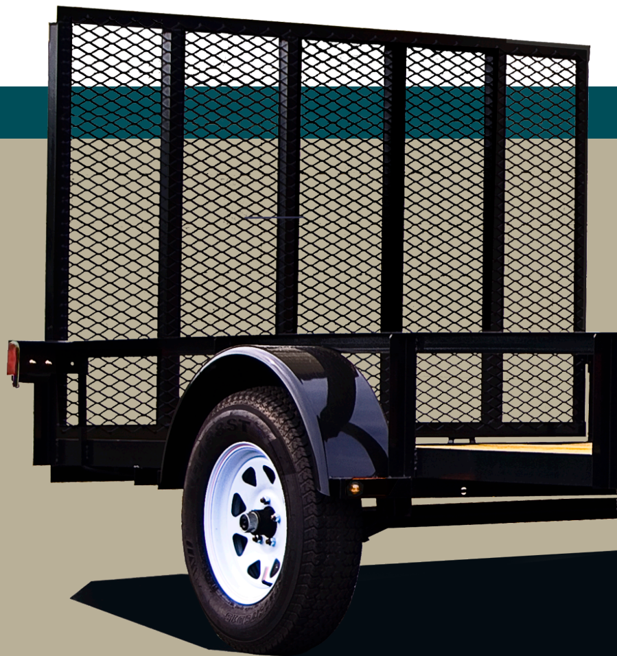
Photo: R 6-4x12 Residential Series Single Axle Rail Utility Model